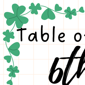
Table of Contents 6th Grade